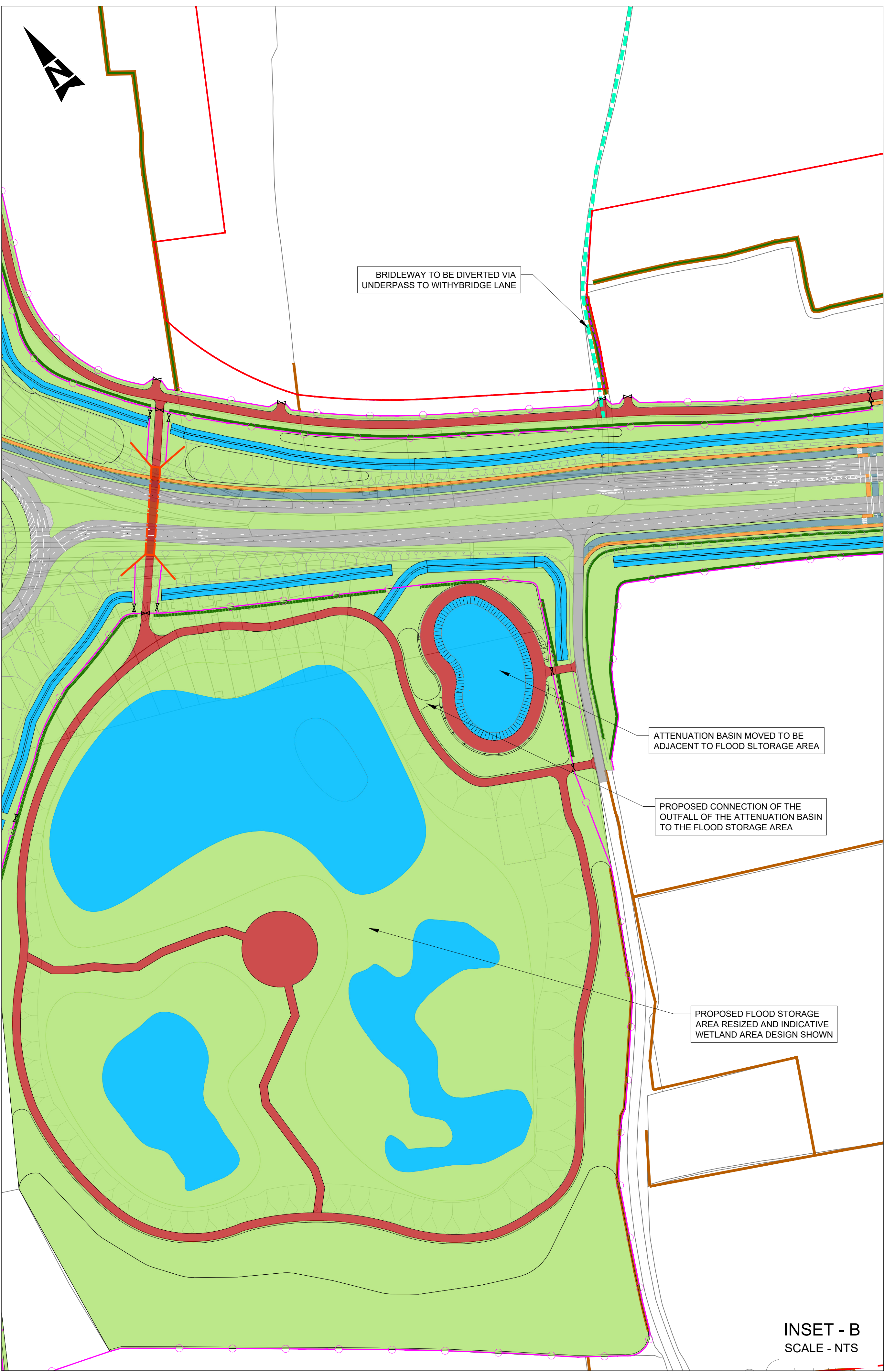
INSET - B SCALE - NTS